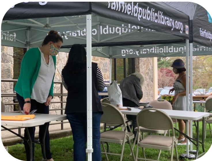
Star Wars Art for Adults, May 2021

The staff couldn't be more helpful and kind. They're just over the top. And Reference can find ANYTHING!!