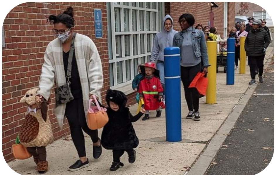
Halloween Parade, 2021

The library did a great job during the pandemic. I really appreciated the curbside pick up when we were not able to go into the library. I also appreciated being able to go into the library later on so that I could browse. The staff was always patient, considerate and friendly.